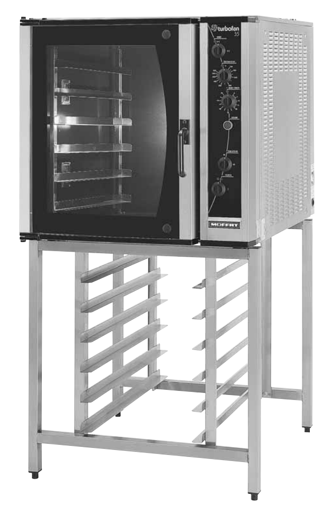
E35 shown on optional A26W stand